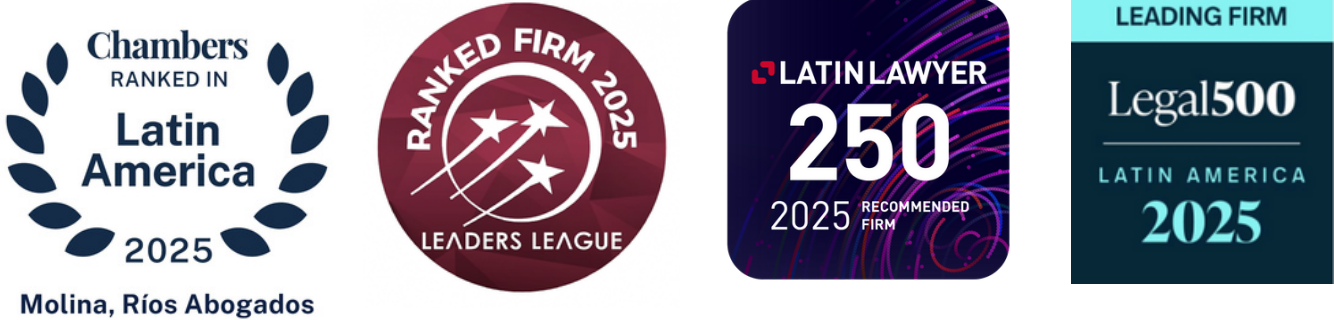
Molina, Ríos Abogados